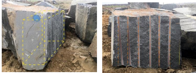
Splitted block by hydro shims

Borehole deviation when performing drilling operations for overall drilling of massif can cause to increased separation area, increased tool costs and poor quality of block production.